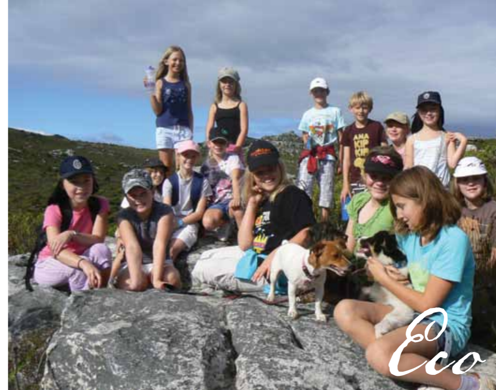
■ The Eco-Club took advantage of a day off school on election day, and, in the early afternoon after parents had had a chance to vote, a group of 25 plus numerous dogs set off from Gate 2 of Silvermine Reserve. We walked up the road in the direction of the waterfall, passing well above it and man, woman, child and dog had a splendid time in the fresh air.