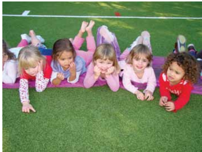
■ The Pre-Preparatory girls testing the new surface.