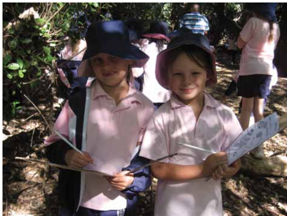
■ The Grade 1 classes went to the Hout Bay Museum Enviro Centre for a bug hunt in the forest. The girls enjoyed the illustrated talk and slide show afterwards, but it was the treasure hunt for sweets that ended the day on a perfect note.