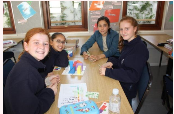
The Grade 6 classes are busy using the Visualisation kits to improve their understanding of shape and space.