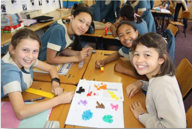
Grade 6 @ Volume activities