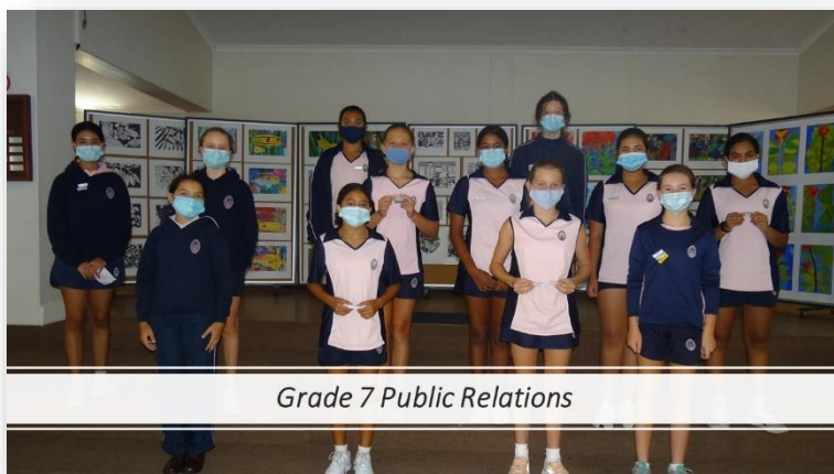
Grade 7 Public Relations