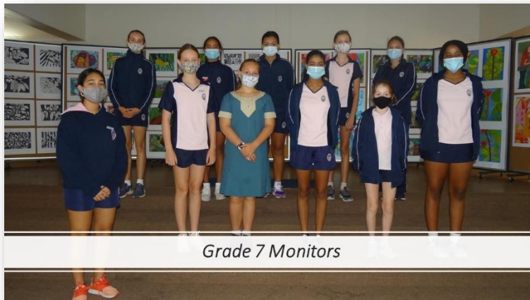
Grade 7 Monitors

The Prep proudly presents our 2021 Grade 7 leaders. We know you will serve Herschel with empathy and commitment and we look forward to the year ahead.