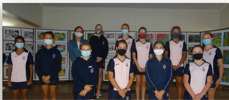
Grade 7 Sustainability