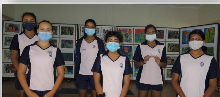
Heads of Music, Library & Spirituality