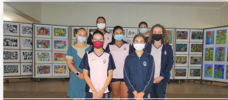
Heads of Service Portfolios