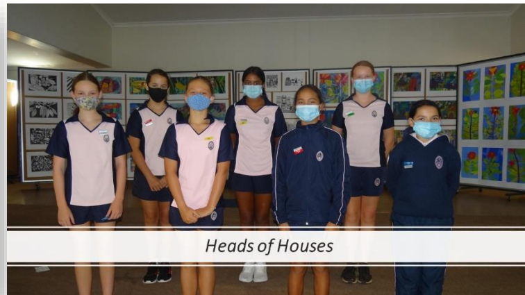
Heads of Houses