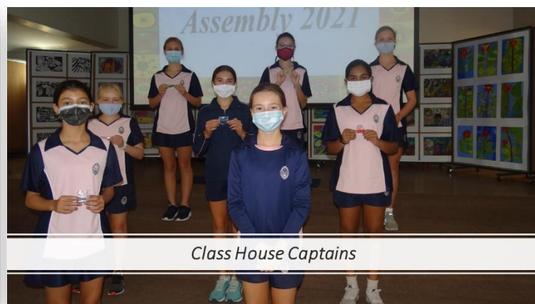
Class House Captains