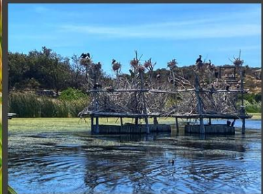
Birds on a Structure I. Gafoor