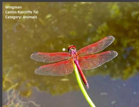
Wingman Caitlin Ratcliffe 7al Category: Animals