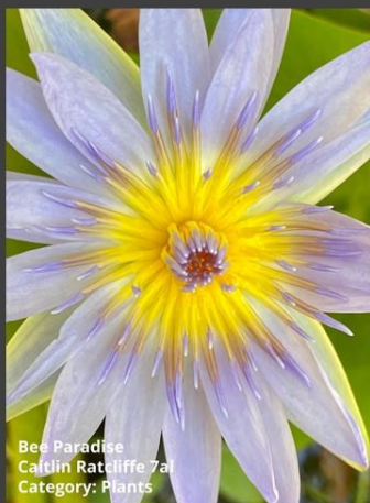
Bee Paradise Caitlin Ratcliffe 7al Category: Plants