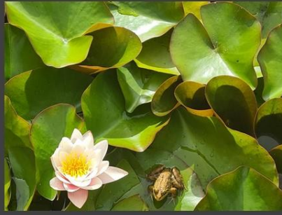
Frog and Water Lily A. Grey