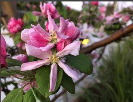
Flower Picture – 2 E. Floquet