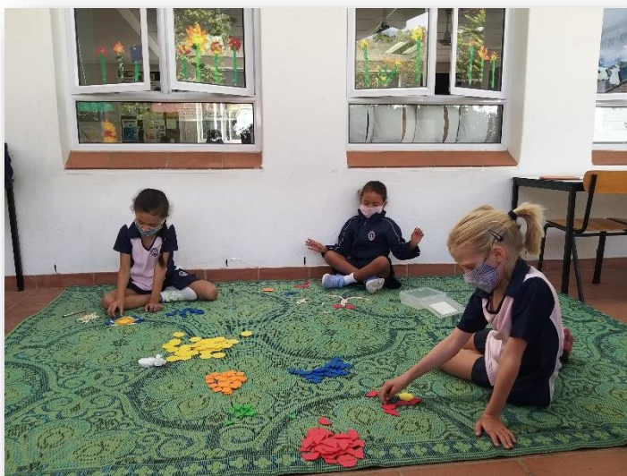
Grade 2s enjoying activities on their outdoor mat.