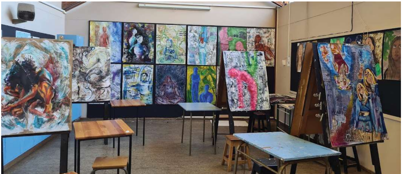
Matric Art Exhibition 2021