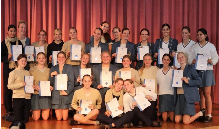
Water polo Awards