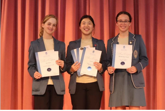
Music and Ensemble Awards