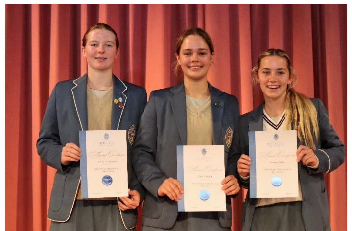
Indoor Hockey Awards