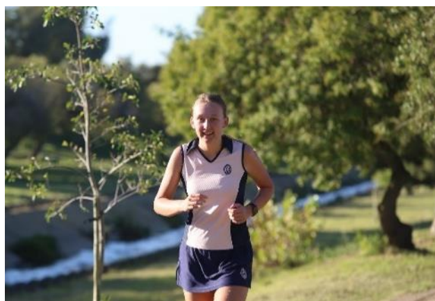
Cross Country - Kerry Buisinne "No human is limited" – Eliud Kipchoge