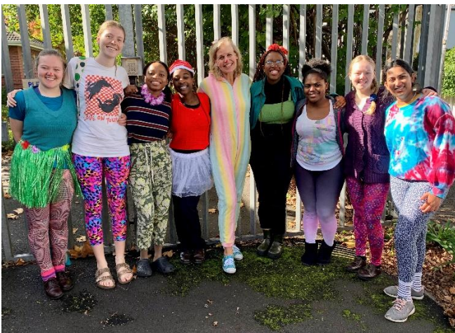
Red Nose Eagle Club