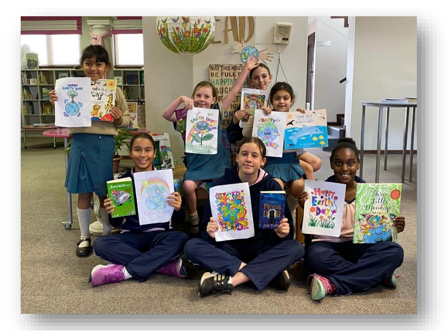
May Eco Activities

This was widely celebrated with various activities in class. Great excitement reigned in the Library as each grade was given a picture to colour. These were entered into a lucky draw and a winner per grade was announced. These girls were able to choose their prize from a selection of books. Thank you to everyone who participated.