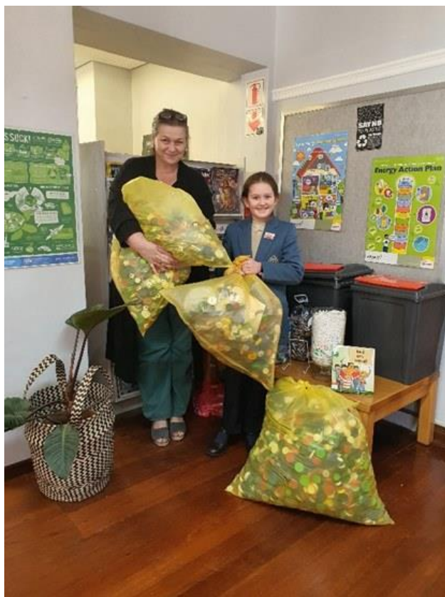
1 - Don't stop collecting bottle tops!