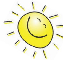
Mr Sun came out so we could play outdoors too.