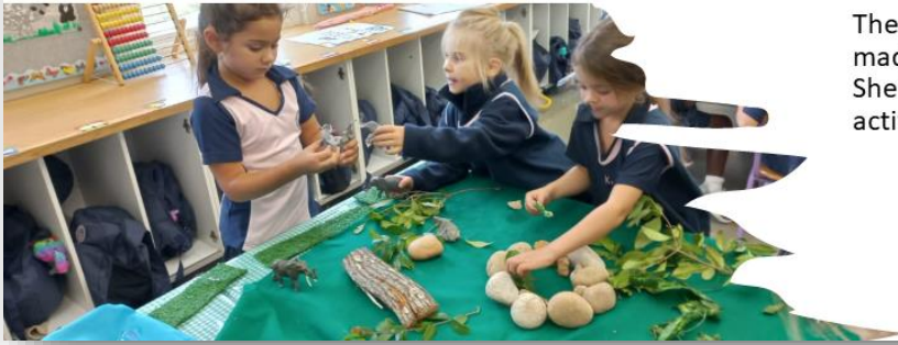
The Grade R girls are learning about the letter 'e'. They made egg and mayo sandwiches for the Haven Night Shelter and played with elephants on their small world activity table.