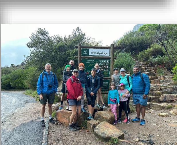
Can Collection - 23 March

There is much excitement about the grade CAN CASTLE competition which happens between 06:34 and 07:30 next week Thursday, 23 March. Please can the cans be clean and counted. The brief given is: Use a maximum of 750 cans to build a creative castle in your 1m x 1m allocated space which is as tall as can be, as creative as you can manage but at the same time, sturdy and not easy to topple. You may add embellishments at the end such as a moat, a flag, an entrance or doorway. NO GLUE OR TYING together of cans is allowed. The sturdiness comes from building a strong base and working upwards from there. ALL EXTRA cans not used in the Can Castle will be put into the Can Bags. The Sustainability girls and Grade 5s will help keep tally of the total. Judges' decision is final!