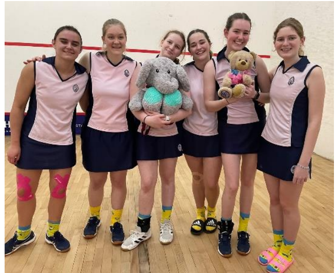
The Squash team placed 6 th overall.

The Herschel 1 st Squash team and u14A, u16A and 1 st Hockey teams took part in the Top Schools Tournaments from Wednesday 9 August to Saturday 12 August. Only the 12 top schools in the country were invited to participate in these tournaments and we are very proud to have had four teams representing Herschel.