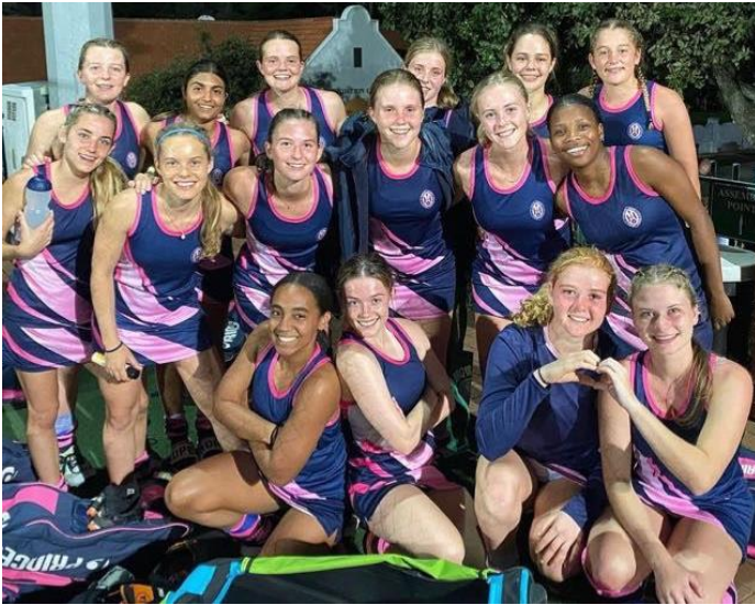
The 1 st Team Hockey placed 12 th .