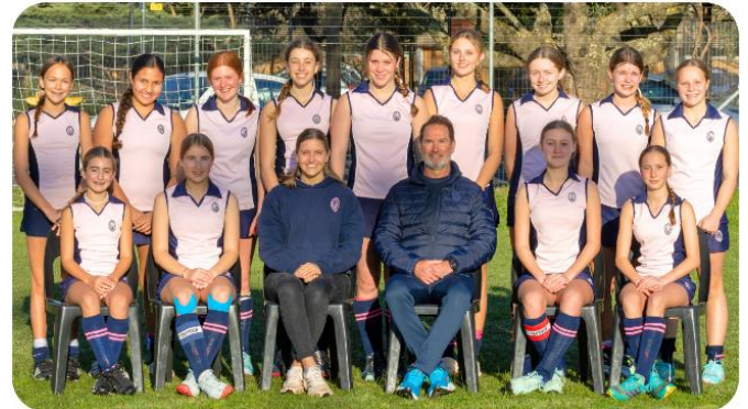
The u14A Hockey team placed 10 th overall.