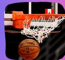
2nd & U16B Team AICT Basketball Tournament Saturday 21 October American International School