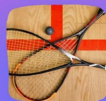
Squash Stayers Tournament Thursday 19 - Sunday 22 October Various Venues