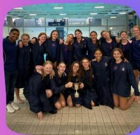
U14A Team Roedeane Waterpolo Tournament Thursday 26 - Sunday 29 October Roedeane, Gauteng