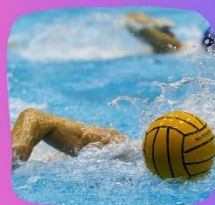
2nd Team Somerset College Stayers Tournament Saturday 21 & Sunday 22 October Somerset College