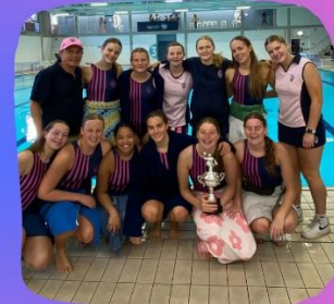
1st Team St Stithians Stayer Tournament Wednesday 25 - Sunday 29 October St Stithians, Gauteng