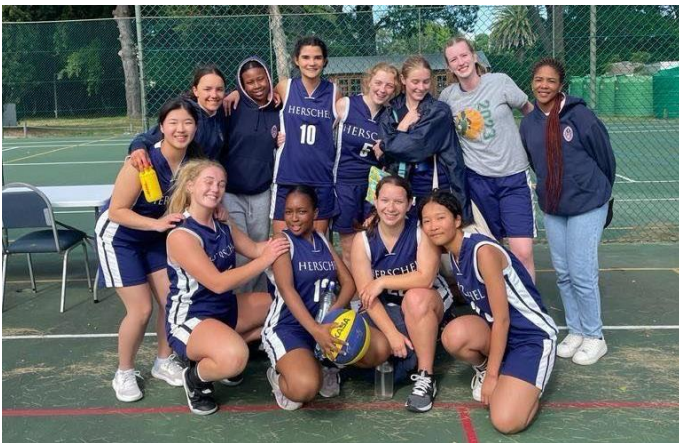
2 nd Team